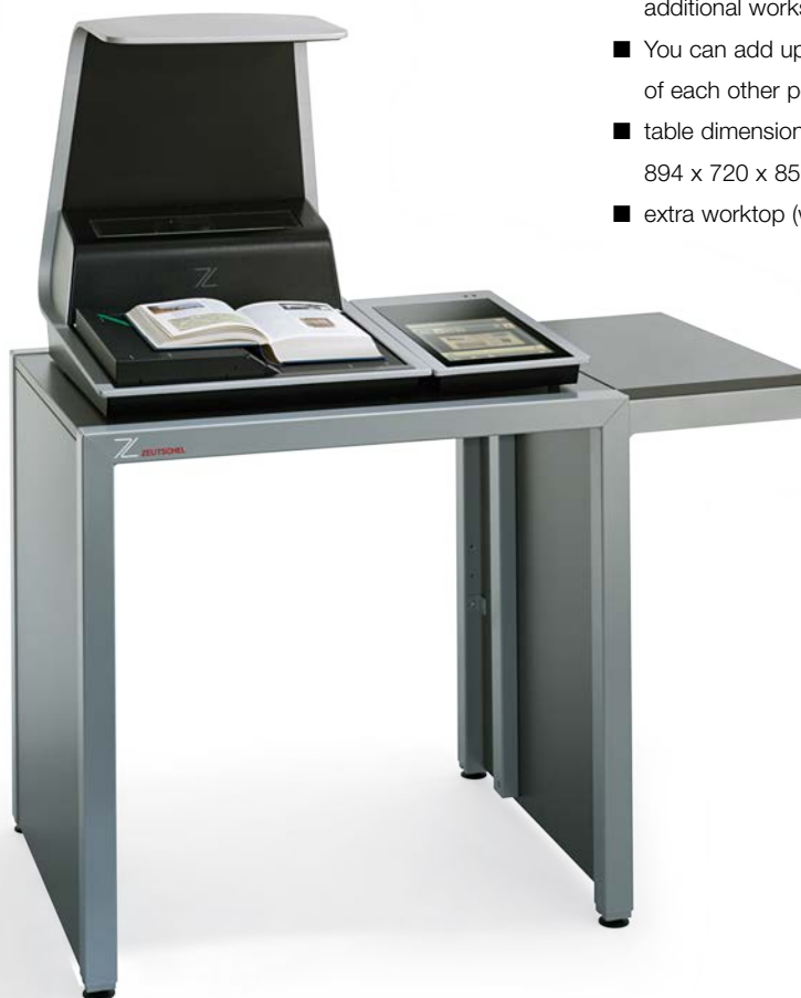
Table zeta (with worktop extension)

Zeutschel scanners and microfilm cameras are high-tech equipment for perfect digitization of bound and large-format originals. We recommend the use of original Zeutschel tables to ensure a more ergonomic and safer working environment for our scanners. These tables are easy to assemble, provide sufficient workspace and the height can be adjusted to suit individual requirements, in some instances, electrically.